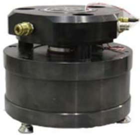
Air Bearing Shaker

The Models K394A30 and K394A31 Calibration Shaker Systems represent a new level of performance in calibration grade shakers. As the centerpiece of these systems, the 396C10 and 396C11 air bearing shakers continue the award winning PCB Group tradition of providing superior performance characteristics and ease of use while offering exceptional value and simplicity. A graphite air bearing combined with an ultra-stiff lightweight armature essentially eliminates transverse motion that plagues traditional flexure based shaker armature suspension systems.